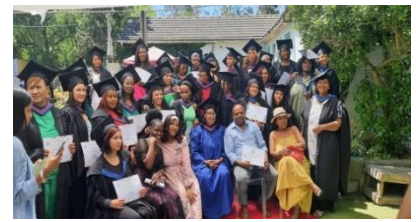
Above: A Train the Trainer workshop in progress; an 8 week computer course group at the Grassroots Centre in Athlone and the beautician and massage therapy students graduate.