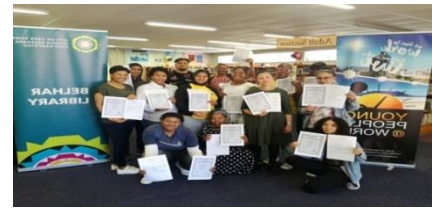
Above: Reps from Remax Property Group during our 2 nd Entrepreneurs Festival; an 8 week computer course group received certificates; Participants at a local library received certificates after free computer training.