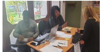
Above: Group 4 during their site visit to Remax Impact Property Group in Grassy Park and participants at our open business workshop for entrepreneurs on 31 March 2023 and Mzansi Business Services hosted a free onsite Helpdesk to assist participants with free advice on tax and legal compliance.